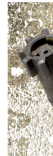
All parts are well fitted using quality Mil-Spec components. The SOT-badged Mil-Spec bolt carrier sports an MP-tested bolt.

Upper and lower receivers are Mil-Spec, as are countless other parts on the SOT Hanson such as the trigger group, buffer tube and bolt-carrier group. The gas tube and gas block are coated in Melonite to minimize damaging effects of wear and corrosion. It's worth mentioning that the Melonite coating on these parts is standard across the whole line of products from Special Ops. You don't have