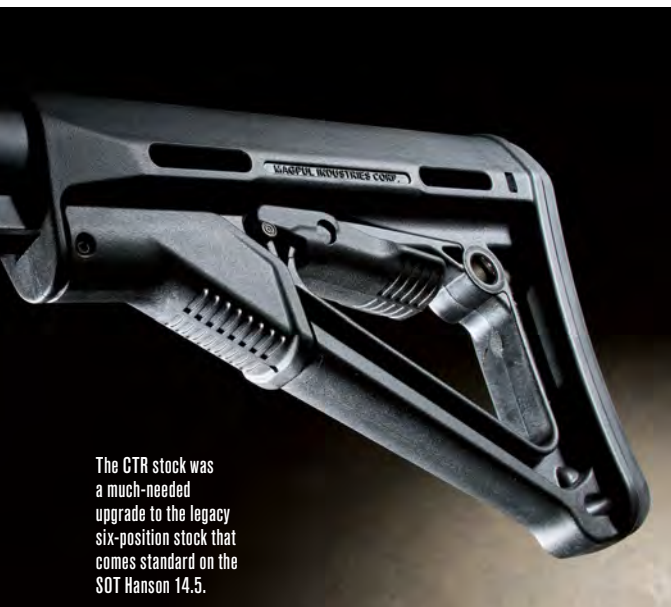
The CTR stock was a much-needed upgrade to the legacy six-position stock that comes standard on the SOT Hanson 14.5.

A set of Magpul MBUS comes standard on the SOT Hanson 14.5. They are quality, capable sights for tactical work. Inset: The MBUS folds cleanly out of the sight line should you choose to employ a low-profile optic.