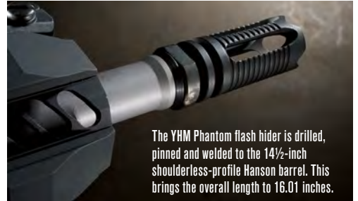
The YHM Phantom flash hider is drilled, pinned and welded to the 14½-inch shoulderless-profile Hanson barrel. This brings the overall length to 16.01 inches.

Special Ops Tactical guarantees sub-MOA accuracy from this rifle when it is coupled with high-quality ammo. Many shooters should find this comforting, as it takes out the factor of the gun when shooting performance is not what one thinks it should be. Personally, I like knowing that the tool I'm using is better than I am, because then I am (mostly) free of any blaming or excuses for poor accuracy. In my mind it allows me to focus on improving