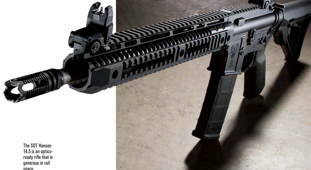
The SOT Hanson 14.5 is an optics-ready rifle that is generous in rail space.

In fact, I can't remember the last time I've shot a rifle with a barrel length beyond the 12-inch marker. I know there are some ballistic disadvantages that come with shorter barrel lengths, but I don't care. I mean, I do care. It's just that I'm convinced, should I have to use a rifle for protection purposes, it will more than likely be within effective ranges for short barrels.