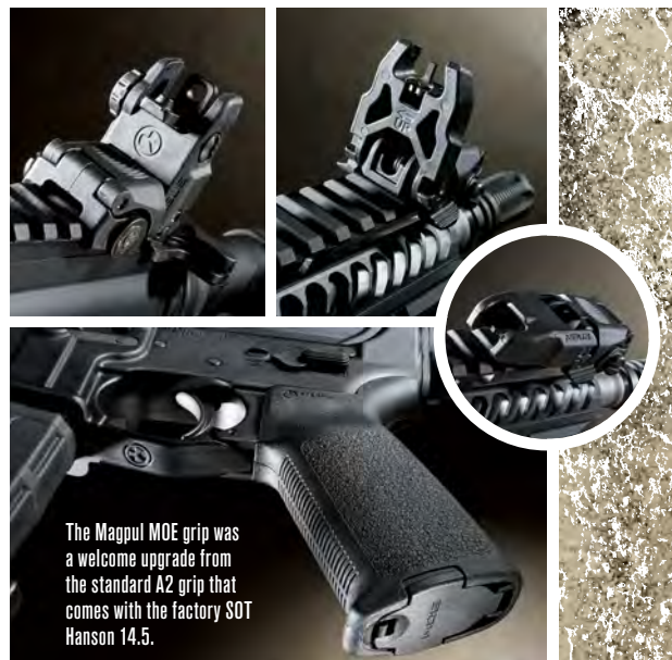
The Magpul MOE grip was a welcome upgrade from the standard A2 grip that comes with the factory SOT Hanson 14.5.

A set of Magpul MBUS comes standard on the SOT Hanson 14.5. They are quality, capable sights for tactical work. Inset: The MBUS folds cleanly out of the sight line should you choose to employ a low-profile optic.